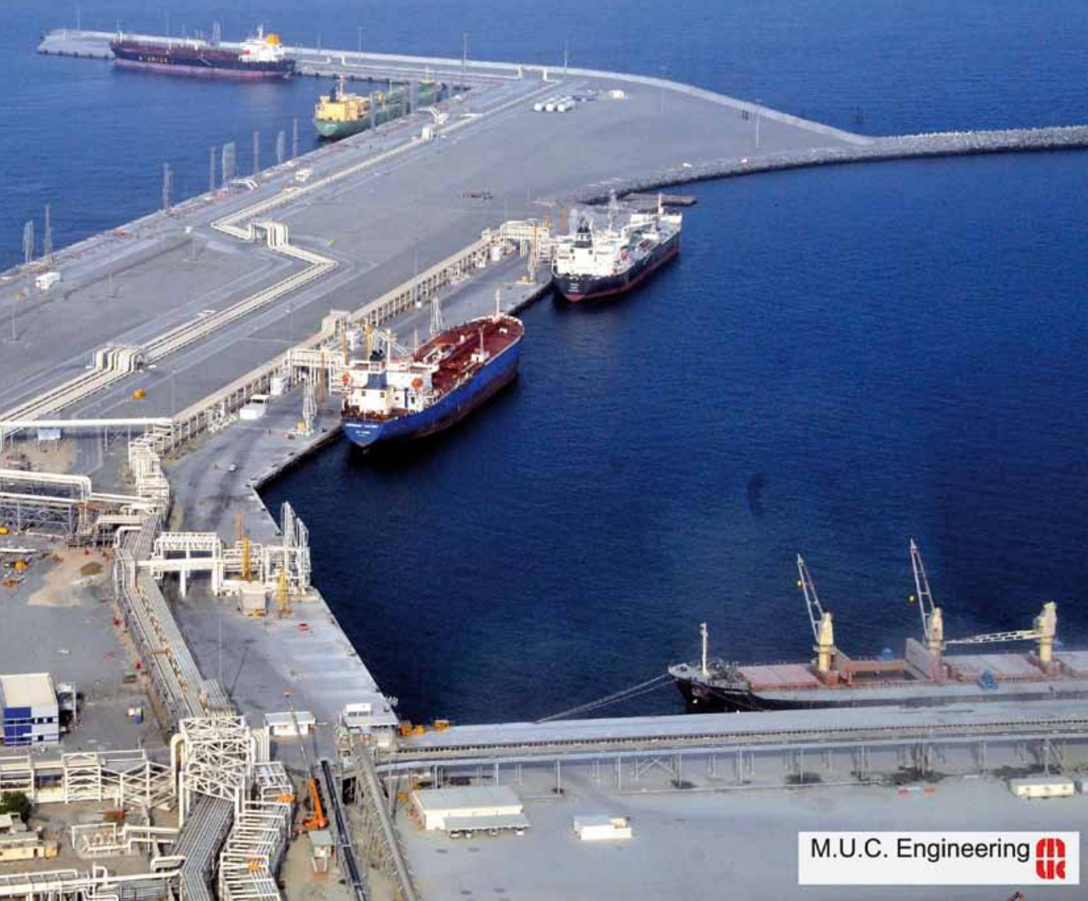
Main image: Fujairah's second oil terminal (OT2); Bottom right: Maiden call at OT2 in May 2010.

terminals. As a result, the total capacity of all commercial storage terminals is increasing and is expected to reach 8 million cubic metres by the end of 2014. Consequently, the anticipated throughput through the Fujairah oil tanker terminal could reach an annual 70 million tonnes at the end of 2014. This is exclusive of the crude which is being exported through the Abu Dhabi Crude Oil Pipeline (ADCOP). With the six berths on its jetty being fully occupied, VHFL has also started the construction of pipelines connecting its terminal to the Port of