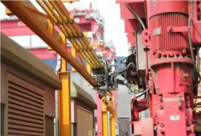
Caption: The “Drive-In P” solution from Conductix-Wampfler