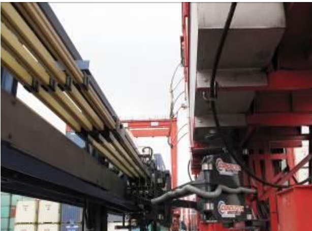
Caption: Since 2009, E-RTGs equipped with the "drive-in" system have been moving about the container corridors of the Shekou Container Terminal in China.