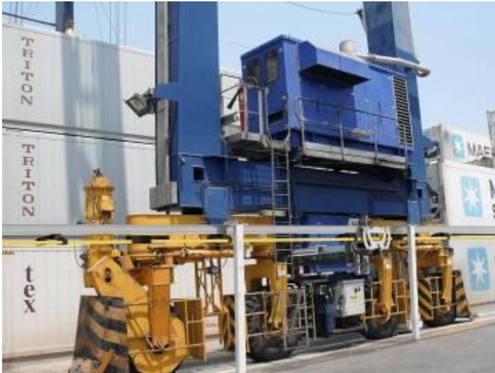
Caption: The compact "Drive-In L" system is the lightest on the market and is suitable for any RTG type.