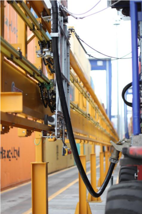
Caption: The plug-in solution from Conductix-Wampfler in use at Marport near Istanbul.