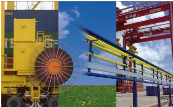
Caption: The electrification of rubber tyred gantry cranes (RTGs) is an approach with an environmentally compatible approach which has already made it possible to save millions of Euros and tons of CO2 around the globe.