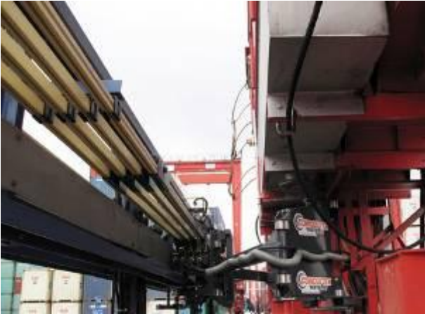
Caption: Electrification solutions of Conductix-Wampfler help to considerably reduce diesel consumption, CO2-emission and energy costs of container cranes

Reprint free of charge, please forward a copy.